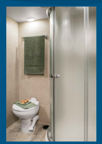
Sidewinder baths offer a large radius shower with glass enclosure, skylight, towel bar and porcelain toilet.

The 3511DK bedroom includes a large wardrobe slide, plus wardrobes on both sides of the bed when equipped with the standard gueen bed. If you need more sleeping surface, an optional king bed is available. Features include a padded headboard with hidden flip-down storage and an overhead shelf with multiple outlets. The wardrobe slide extends into the bathroom and includes linen storage. An extended countertop offers more workspace. and a medicine cabinet. Added features include under-sink storage and under-countertop trashcan placement.