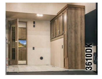
Inside the garage, you'll find additional storage, making the best use of available space.

Shown here are the components of the optional Off the Grid Package, which includes a solar panel, power inverter and the monitor panel!