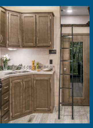
3610DK loft with ladder for additional sleeping.