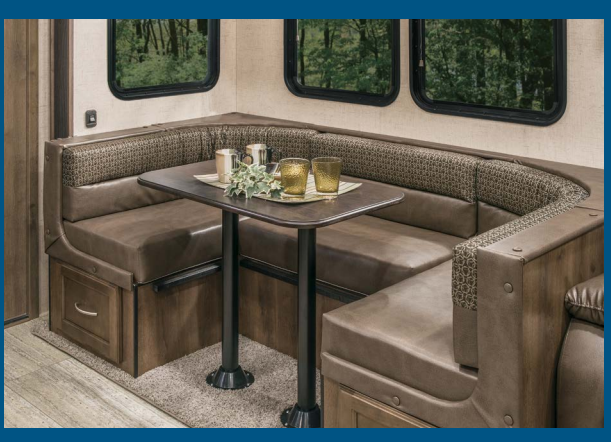
The 3610DK's oversized wraparound U-dinette table drops down to make a comfy sleeping surface.