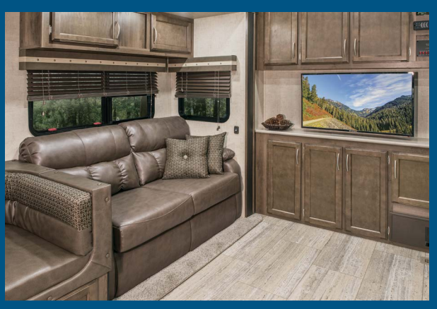
The residential-grade sofa converts into a bed, and tinted windows slide open for excellent cross-ventilation.