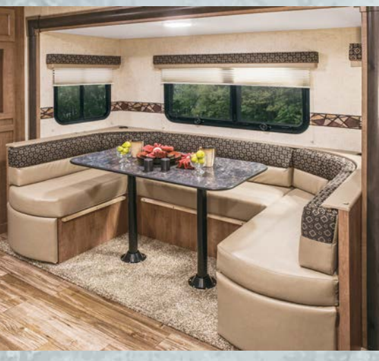
All MXTs offer large, comfortable dining areas, and most convert to additional sleeping spaces.