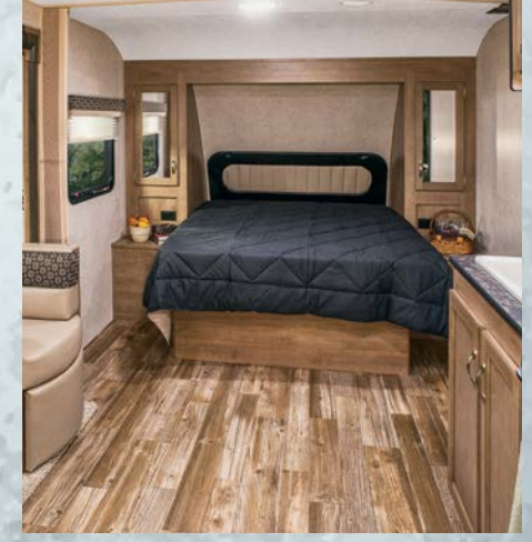
Designer headboard and under-bed storage. Sleeping areas offer bi-fold privacy doors.