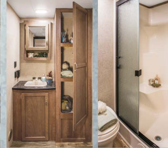
Baths offer a 48-inch residential shower with seat and plenty of storage.