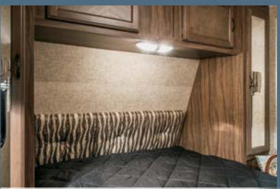
S302BH Designer padded headboard is handcrafted by our in-house sewing department.