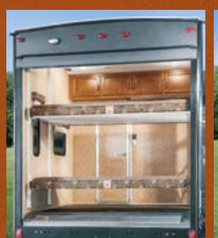
The MXT319 garage easily converts into additional sleeping space with the optional double over double power beds.