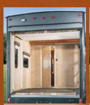
At 7' tall, the MXT319 garage allows for taller ATVs.