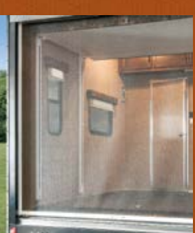
Part of the MXT package, the full rear wall screen door offers fresh air to the garage.