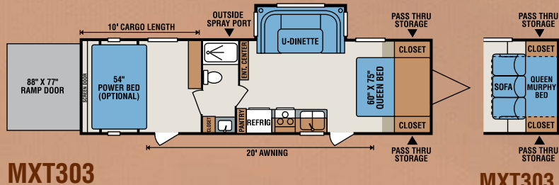
MXT303 Murphy Bed Option