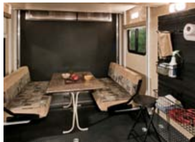
At left, the available sit-n-sleep power bed and 10' garage with available patio door.