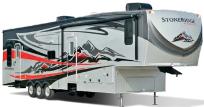
Above, 41CKS shown with optional full body paint.