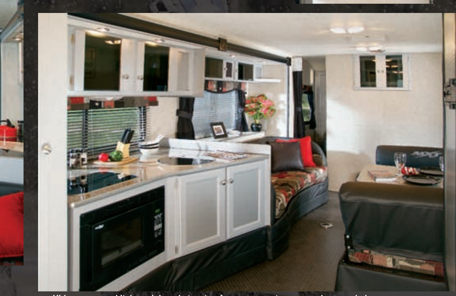
Hide away your kitchen sink and stovetop for more counter space when needed. Shown with cocktail table removed for added floor space.