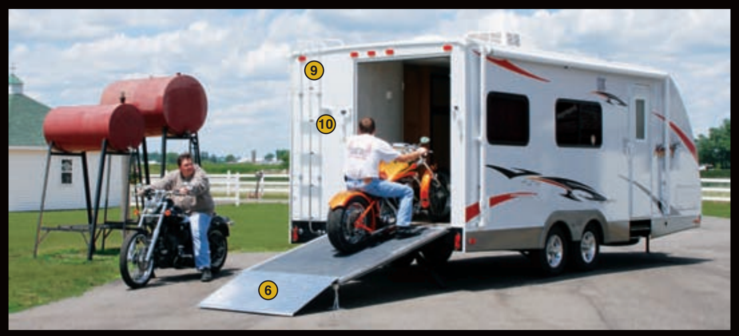
Load your toys with relative ease using our standard equipped ramp extension and legs.