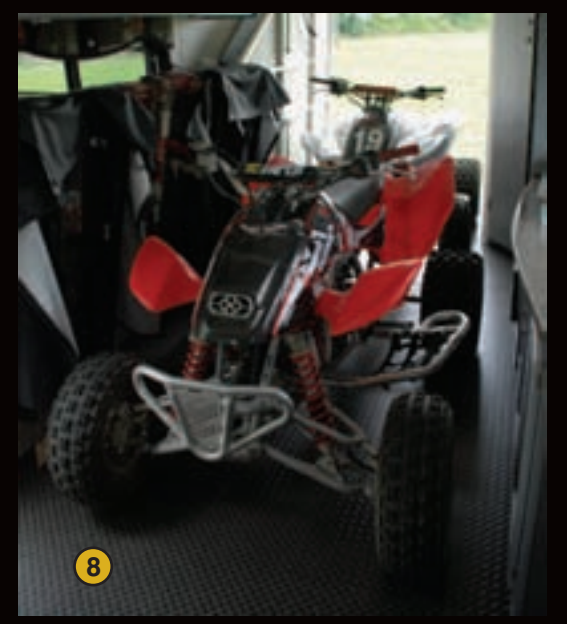
The MXT's spacious interior can accommodate 2 to 4 bikes or 2 four wheelers when the furniture is stowed in the upright position.