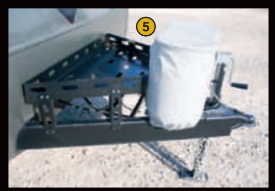
Stow your generator, fuel cans and other essentials on our lightweight utility tray.