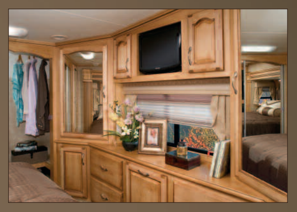
▲ HANDSOME OVERHEAD BEDROOM CABINETRY FEATURES A 19" LCD TV.