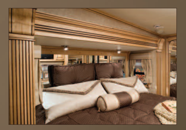
▲ 36 KSB FLOOR PLAN SHOWN WITH SABLE DECOR AND GLAZED MAPLE CABINETRY