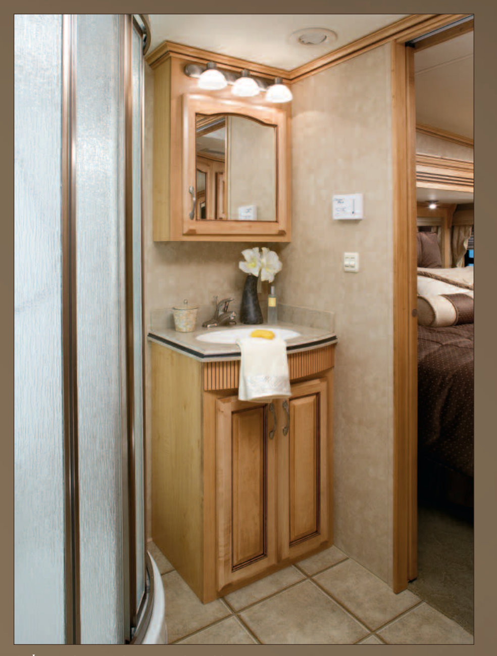
▲ LARGE CORNER SHOWER WITH SLIDING GLASS DOOR IS A STANDARD BATHROOM FEATURE.