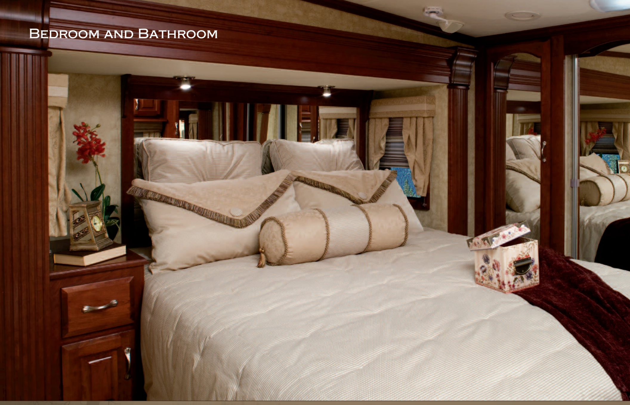
▲ 37 SB FLOOR PLAN SHOWN WITH CASHMERE DECOR AND CHERRY CABINETRY