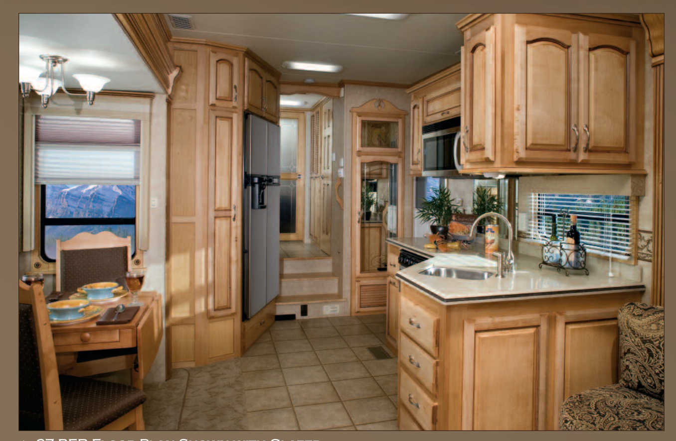
▲ 37 REB FLOOR PLAN SHOWN WITH GLAZED MAPLE CABINETRY AND SABLE DECOR

► THE LIVING ROOM TABLE FEATURES A LEAF, LIFT-UP STORAGE AND SILVERWARE DRAWER.