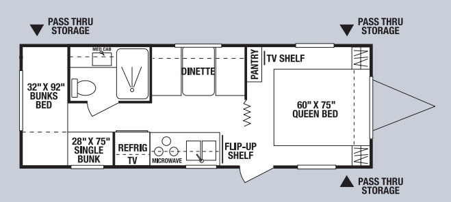
240BH • UVW 3988 • Dry Hitch Wt. 535 • NCC 3012 • Length 26'9"