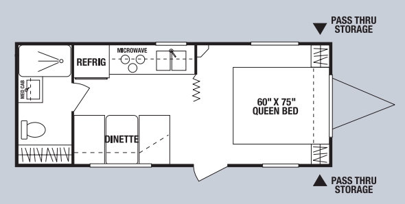
200RB • UVW TBA • Dry Hitch Wt. TBA • NCC TBA • Length 21'6"