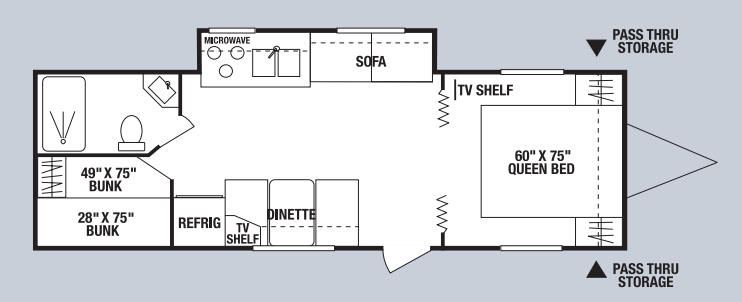
290BHS • UVW 4924 • Dry Hitch Wt. 693 • NCC 2076 • Length 30'6"