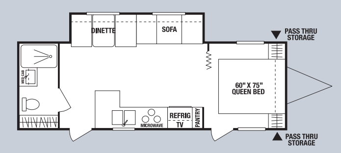
260RBS • UVW 4400 • Dry Hitch Wt. 560 • NCC 2600 • Length 27'7"