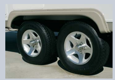
The Spree sports aluminum wheels as a standard feature.