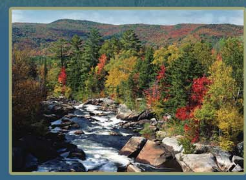
"Together"... Discover More!