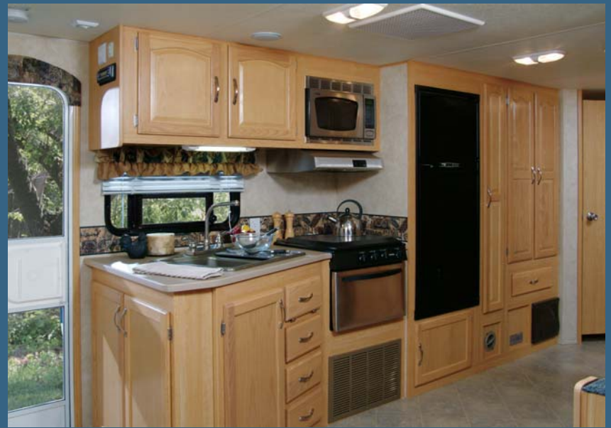
The kitchen area features the clean contemporary look of brushed stainless steel as well as raised panel cabinets with mortise and tenon cabinet doors.