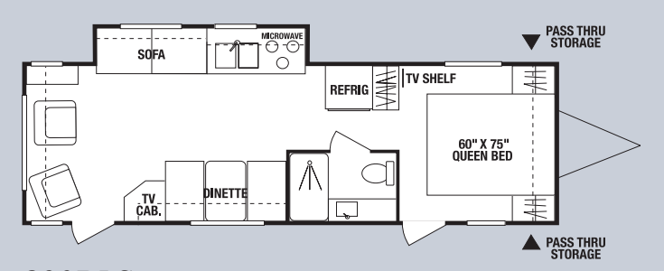
290RLS • UVW 4834 • Dry Hitch Wt. 744 • NCC 2166 • Length 30'6"