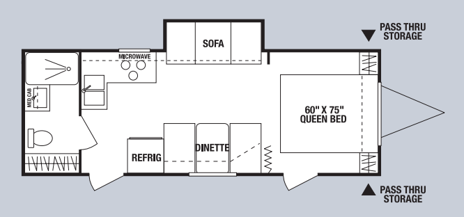
240RBS • UVW 4250 • Dry Hitch Wt. 445 • NCC 2385 • Length27'8"