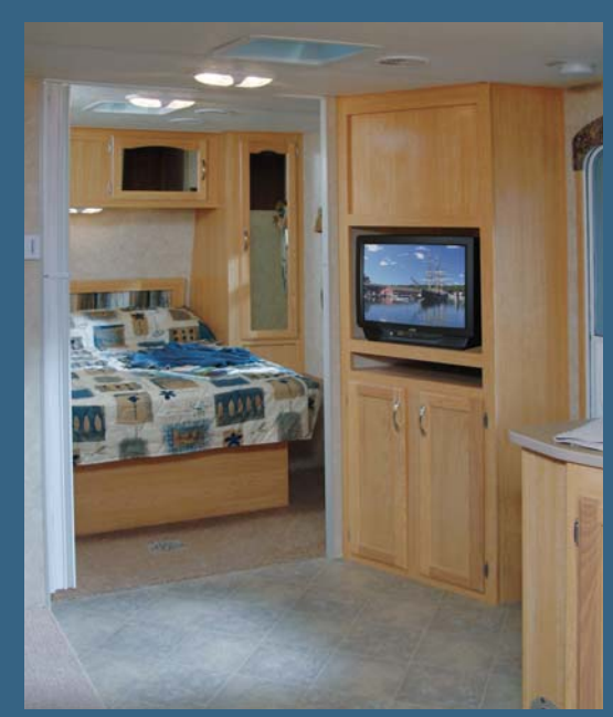
Living area entertainment center cabinet features plenty of base storage and the bedroom side of the upper cabinet provides an additional TV shelf.