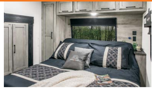
Recharge for tomorrow in the electric tilt bed with a Serta Comfort King Foam Mattress. Storage options abound, and washer/dryer prep is tucked into the closet.