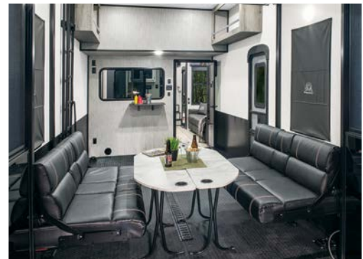
Take a much-needed break and transform the garage into a dining area. Overhead storage compartments allow you to keep your gear organized and out of the way. Elevate the experience even more with options like ramp door patio rails and the three-season patio door.