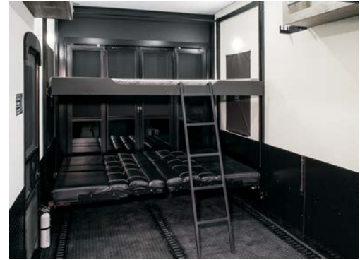
The roomy garage is versatile, functioning as a garage, bedroom, and dining area. The optional 60" x 84" power bed with sit and sleep rises and falls with ease, allowing you to customize the space to your needs.