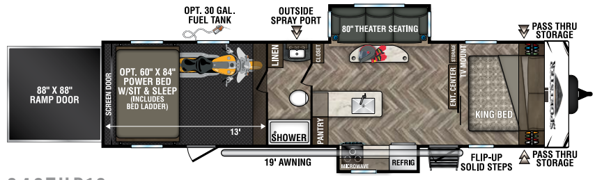
342THR13 UVW - 8,890 | Exterior Length - 39' 1" | Sleeps 6