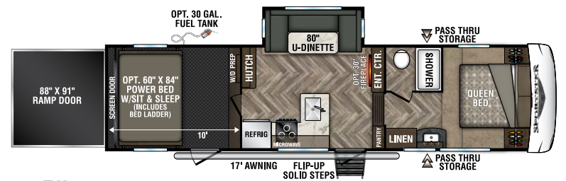
311TH10 UVW - 8,750 | Exterior Length - 34' 2" | Sleeps 7