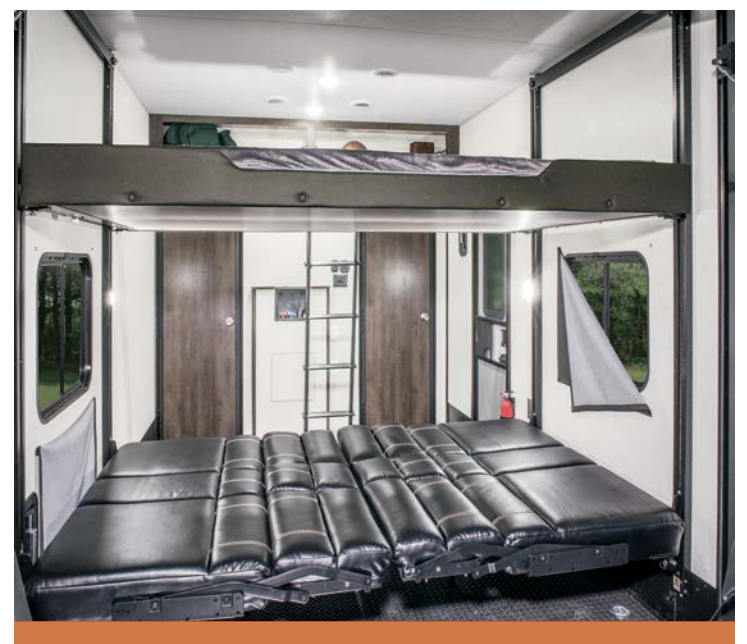
GARAGE CONVERTS EASILY Sportster garages boast Tuff Ply* flooring with 12" protective diamond plate on sidewalls and 90-inch interior height, and feature an optional 60 x 84-inch power bed with Sit-and-Sleep, that folds flat against the walls.