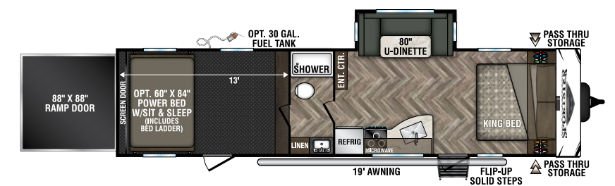
321THR13 UVW - 8,070 | Exterior Length - 37' 3" | Sleeps 7