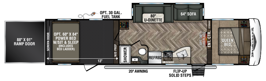
331TH13 UVW - 9,410 | Exterior Length - 38' 8" | Sleeps 8