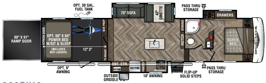
363TH12 UVW - 11,330 | Exterior Length - 42' 1" | Sleeps 8