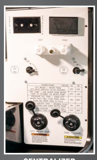
CENTRALIZED COMMAND CENTER heated & all systems