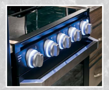
Drop-in COOKTOP with glass cover and OVEN