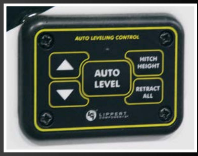
Optional 4-POINT AUTO-LEVELING does all the work