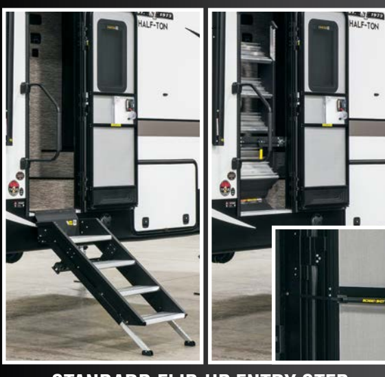
STANDARD FLIP-UP ENTRY STEP solid footing, coming and going. Handy friction hinge with screenshot auto-door-close feature.