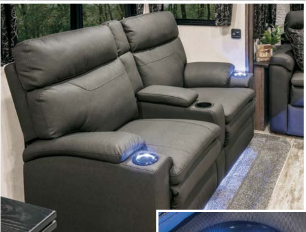
THEATER SEATING with heat, massage, and LED lighted cupholders (on select models)