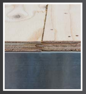
5/8" TONGUE & GROOVE PLYWOOD