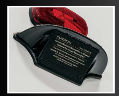
BACKUP CAMERA PREP