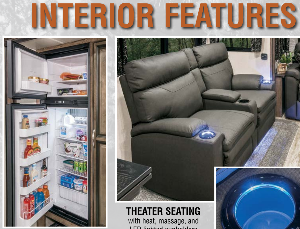
Double door Gas/Electric 8 CU FT REFRIGERATOR with Temperature Controls