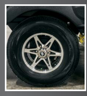
16" 6-lug heavy duty ALUMINUM WHEELS with E-range tires