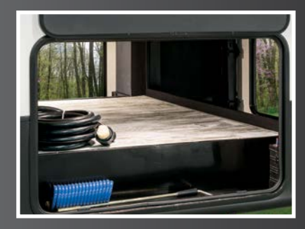
PASS-THROUGH STORAGE featuring motion-lit technology