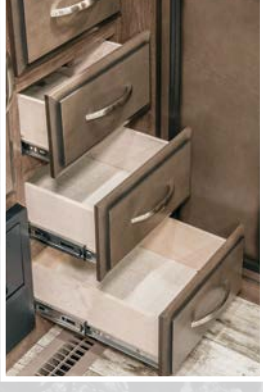
100 LB ball bearing DRAWER GUIDES