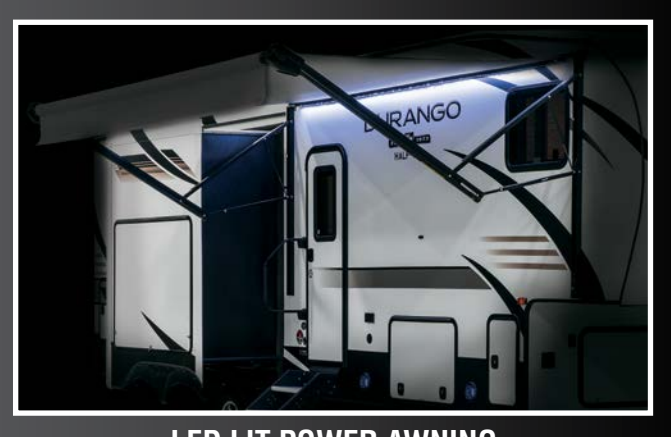
LED LIT POWER AWNING makes it easy to claim your outdoor space