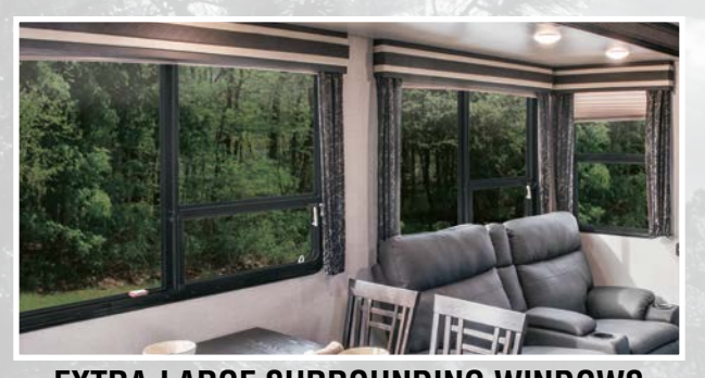
EXTRA-LARGE SURROUNDING WINDOWS