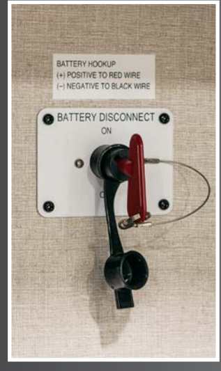
BATTERY DISCONNECT conveniently-located