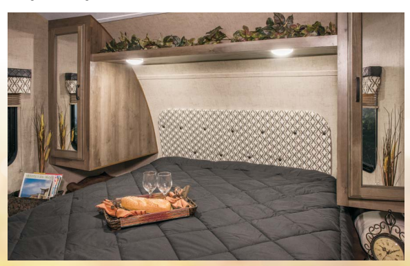
The under-bed storage system is comprised of two baskets on each side, along with under-bed storage, accessed by lifting the 60" x 80" queen bed's plywood base with gas struts.