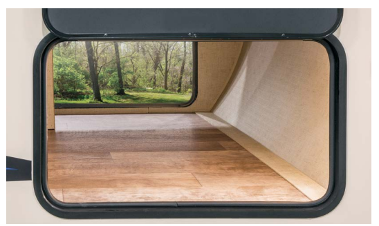
Exterior storage areas are sizable and easy to clean, and include extra-large radius doors with magnetic catches.