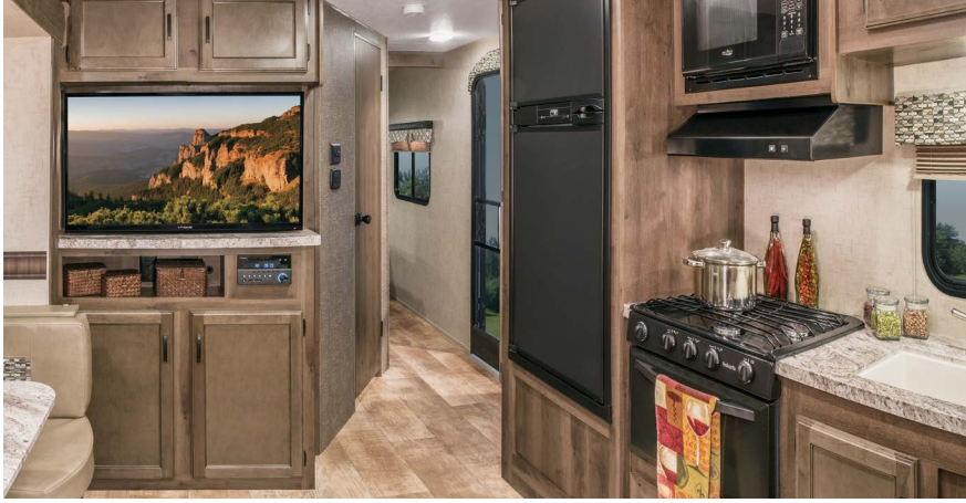
Multi-media stereo that includes a DVD/Bluetooth with NFC wireless connectivity.