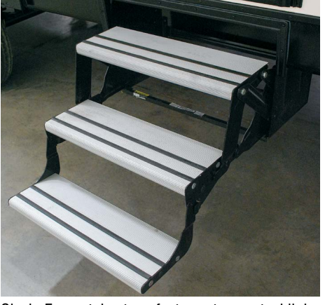
Sleek, Euro-style steps feature strong steel linkage and anti-slip rubber grooves. Aluminum steps resist rust and ensure long-lasting durability.