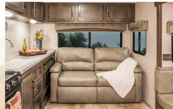
This 241RLK is shown with the optional and convenient tri-fold sofa/bed. Bath area in the new 241RLK includes a radius shower.