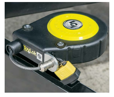
ToyLok<sup>®</sup> is included in the K-Z Advantage Package (Connect only).