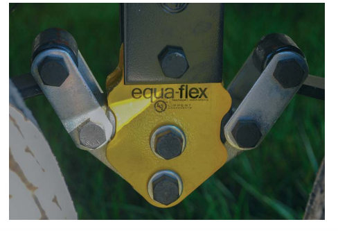
The EquaFlex rubberized equalizer absorbs road shock and reduces fore-to-aft movement.