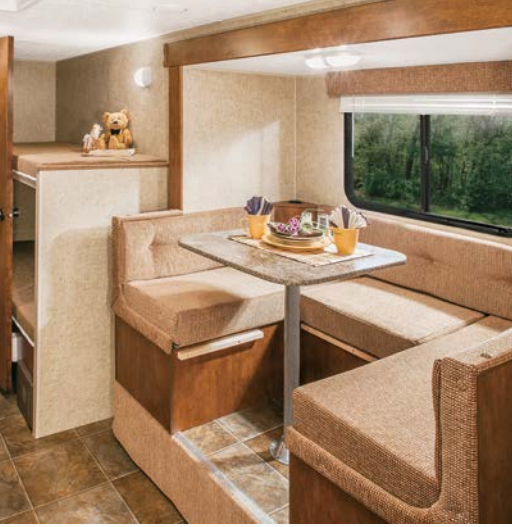
Dining areas are bright and cheerful, with large windows providing additional lighting, and many floorplans offer convertible dinette sleeping areas.