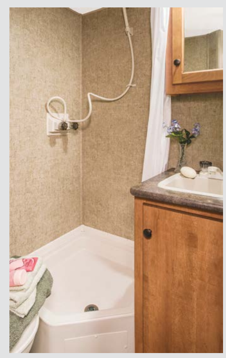
Bath areas are bright and airy, with plenty of room and storage. All offer a shower and toilet (18RBT three-piece bath shown).