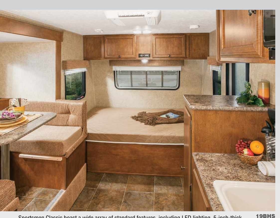
Sportsmen Classic boast a wide array of standard features, including LED lighting, 5-inch-thick dinette cushions, mini blinds, easy-clean linoleum throughout, plenty of counter space and large overhead cabinets.