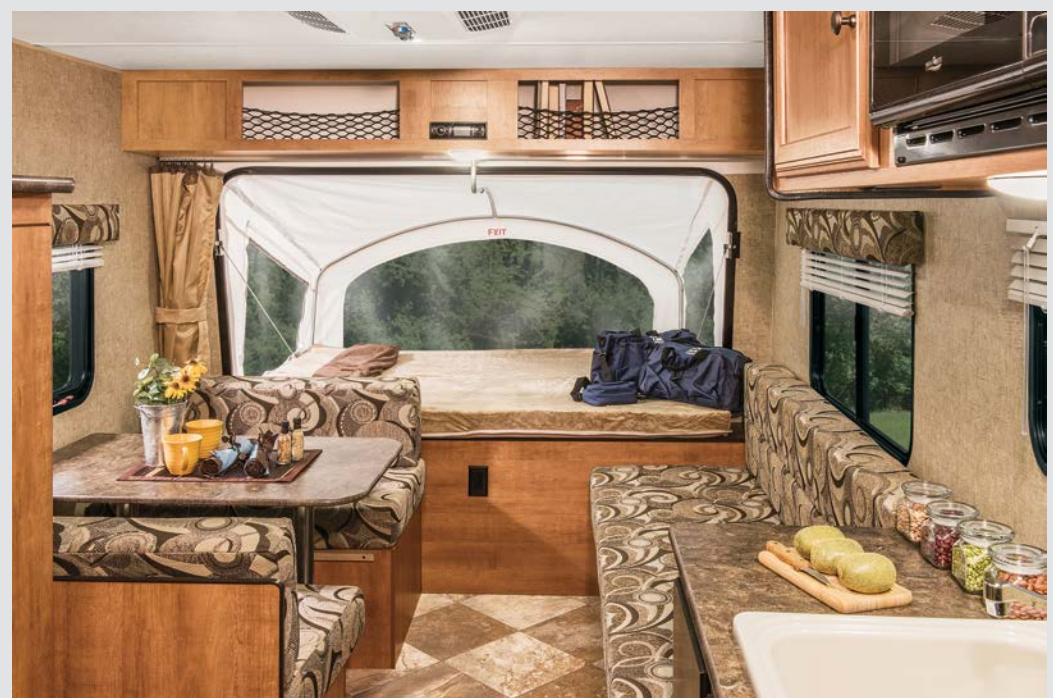
Some Classics are available with expandable foldout bunkends, which offer the ambience of tent camping with the security of solid walls and locking doors. Expandables provide additional living and sleeping space without adding towing length and weight. Sportsmen Classic uses 4-inch-thick bunkend cushions, and Aqualon tent fabric throughout that comes with a 5-year warranty.

Sportsmen Classic provides all the amenities of home in a lightweight, easy to tow package. Classic is versatile and offers your family comfortable, flexible floorplans in a variety of configurations, including expandables, hardsides and even toy haulers.