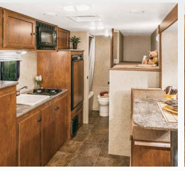
Kitchens are smartly designed for efficient workflow, and include microwave, gas/electric refrigerator and 2-burner stovetop. Ample storage opportunities abound.