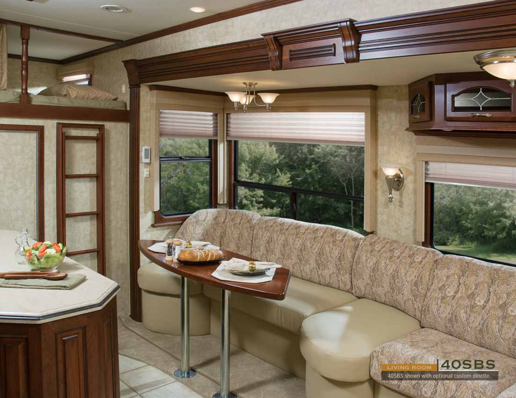
LIVING ROOM | 40SBS 40SBS shown with optional custom dinette.