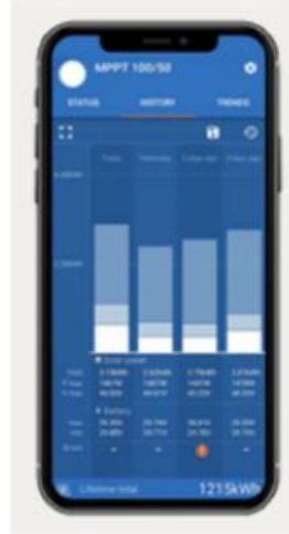
Phone App ( Victron Connect )