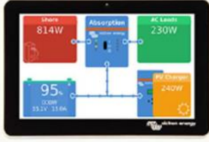
Digital Display Inside Of Unit