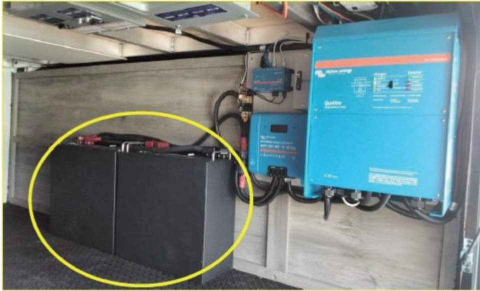
Battery (front view)