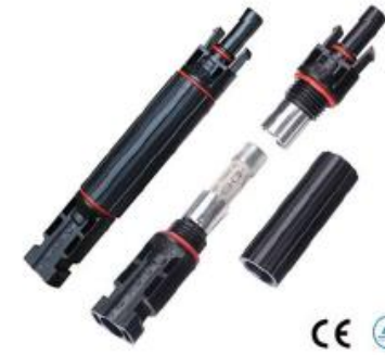
Fuse's On Roof To Protect The Panels & The Wiring