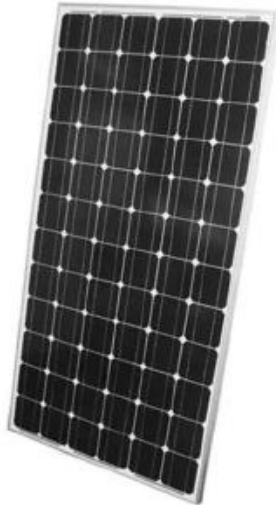
8- 220 Watt Solar Panels